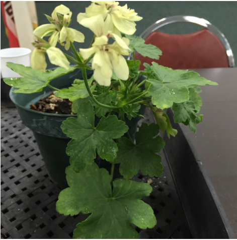
Mellow Yellow Pelargonium