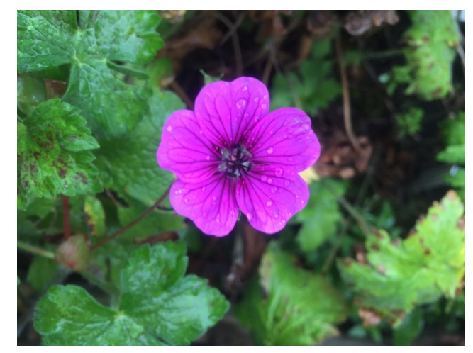
G. Wallichianum Syabru