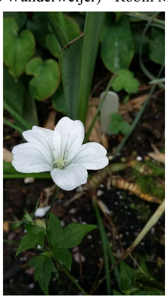
Geranium nodosum 'Silverwood'. Sue Strutt