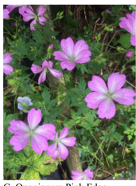
G. Oxonianum Pink Edge -Robin Moss