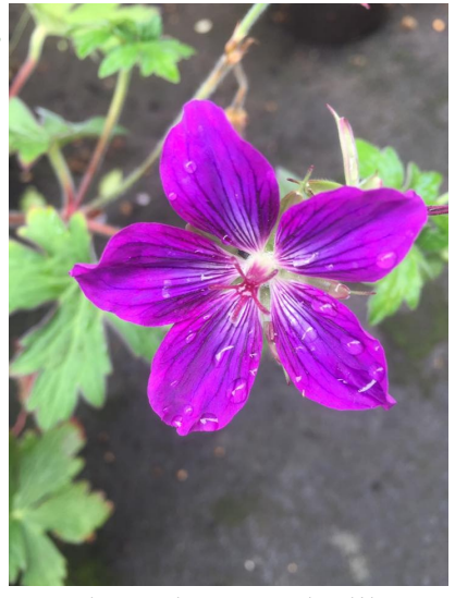
G. wlassovianum Lakwijk Star