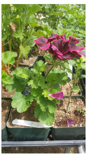
Lord Bute This has a really nice light edge on the petals. Robin had a collection of similar plants with different color combinations