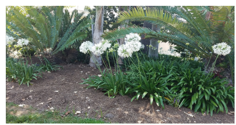
This Agapanthus is at the Huntington Library and is the largest and most impressive Agapanthus (AKA Lily of the Nile) I have ever seen.