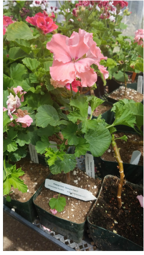
Georgia Peach has the most amazing peach color.