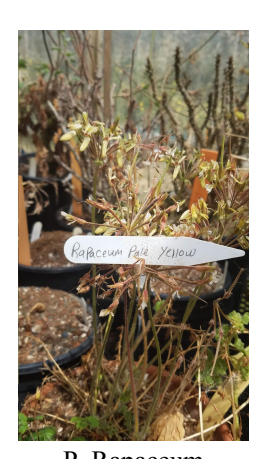
P. Rapaceum This is one of Robins rare pelargoniums. It has an underground tuber and can resprout after a fire.