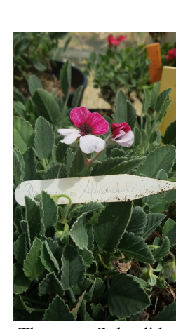
The name Splendide says it all!