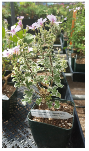
Prince Rupert caught our eye with its white fringe on its leaves.